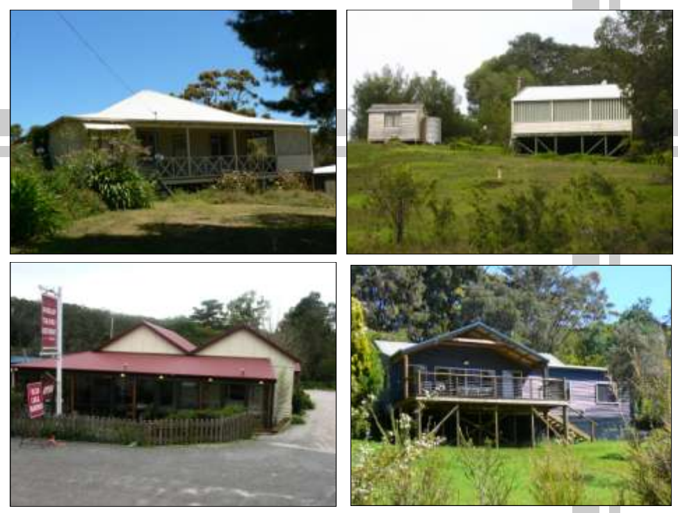
FIG 2.4: Views of existing houses within Nornalup showing some of the dominant design characteristics within the settlement.

The community have also suggested the settlement provide a small village shop to provide small scale retail to complement the services available in Walpole located approximately 10km to the west.