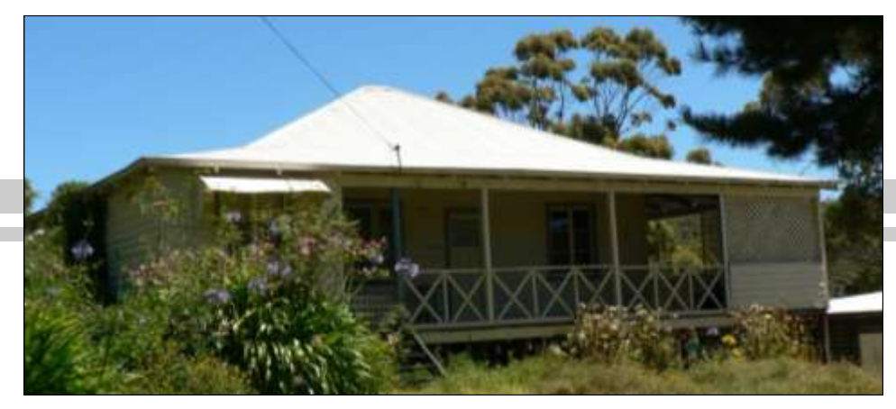
FIG 2.9: Typical built form of many dwellings fronting Riverside Drive and the other older parts of the settlement.