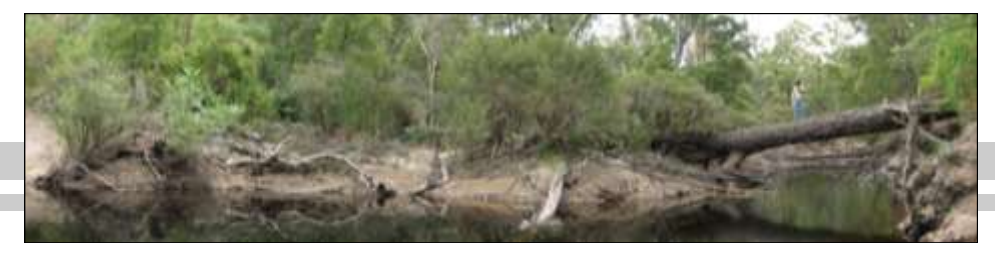
FIG 4.4: Dense vegetation on either side of the Frankland River conceals a number of sites.

The implementation of these recommendations provides a cost-effective, progressive strategy for ensuring heritage management compliance, with associated educational and social outcomes. At the same time, it raises the level of the region's cultural heritage to a level that matches the region's well-documented and valued natural heritage landscape. The celebration of both these values in equal ways will provide for a richer experience for locals and visitors alike. By placing cultural heritage at the top of the land-management agenda, associated environmental values, and management and control methods, are embedded within the process. The natural and cultural values of the area are being restored, and the community remains in control of the cultural connections and knowledge associated with the area.