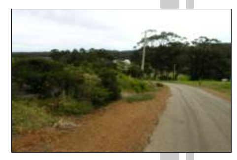
FIG 2.3: Typical streetscape characteristics within Nornalup.