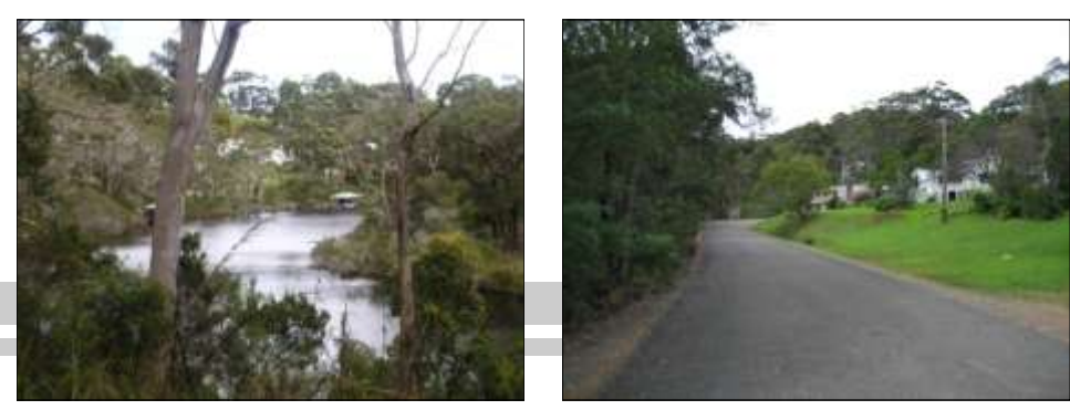
FIG 2.1: General views of Nornalup showing the Frankland River and the relationship many existing dwellings have with existing roads.

Nornalup has developed as a popular holiday, tourist and recreational settlement on the eastern bank of the Frankland River close to the Nornalup Inlet and is surrounded by national parks and nature reserves.