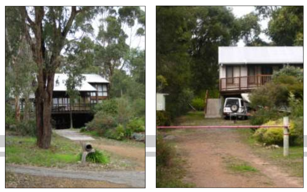
FIG 2.7: Existing dwellings showing typical informal driveway construction.