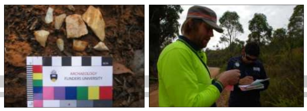
FIG 4.1: Sample of stone artefacts. Stone artefact data provides information pertaining to past settlement, resource procurement and subsistence.

During this time, the Traditional Owners faced enormous pressure and disruption to their traditional way of life. Aside from disease and negative encounters, people were progressively relocated by successive government policies aimed at controlling the lives of Indigenous people. These historical processes have created a situation whereby present-day locals know very little of the rich traditional culture or people from this area. This may contribute to the lack of Indigenous heritage themes and conservation strategies in the local area, and the regular and repeated disturbance to places of cultural significance. Thus, the aim of this study and ongoing projects is to demonstrate the strong cultural connections to the area held by the Traditional Owners and the rich archaeological and ethnographic heritage that is a true wonder of the region. Awareness and understanding of the region must include aspects of the long-term history and features associated with the Bibbulmun people and their ancestors that lived, settled, played, hunted, named, and owned this area.