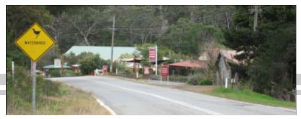
FIG 3.1: Existing Nornalup settlement relationship with South Coast Highway, approaching from the east.

The high rainfall and mild Mediterranean climate of the Nornalup region has considerable ecosystem values for the maintenance of the river flows and the surrounding vegetation, in particular the tall eucalyptus forests of the area. It provides ecosystem service benefits to humans of reliable fresh water, productive and varied agricultural farming systems, outdoor lifestyles and the ability to enjoy nature-based recreational pursuits.