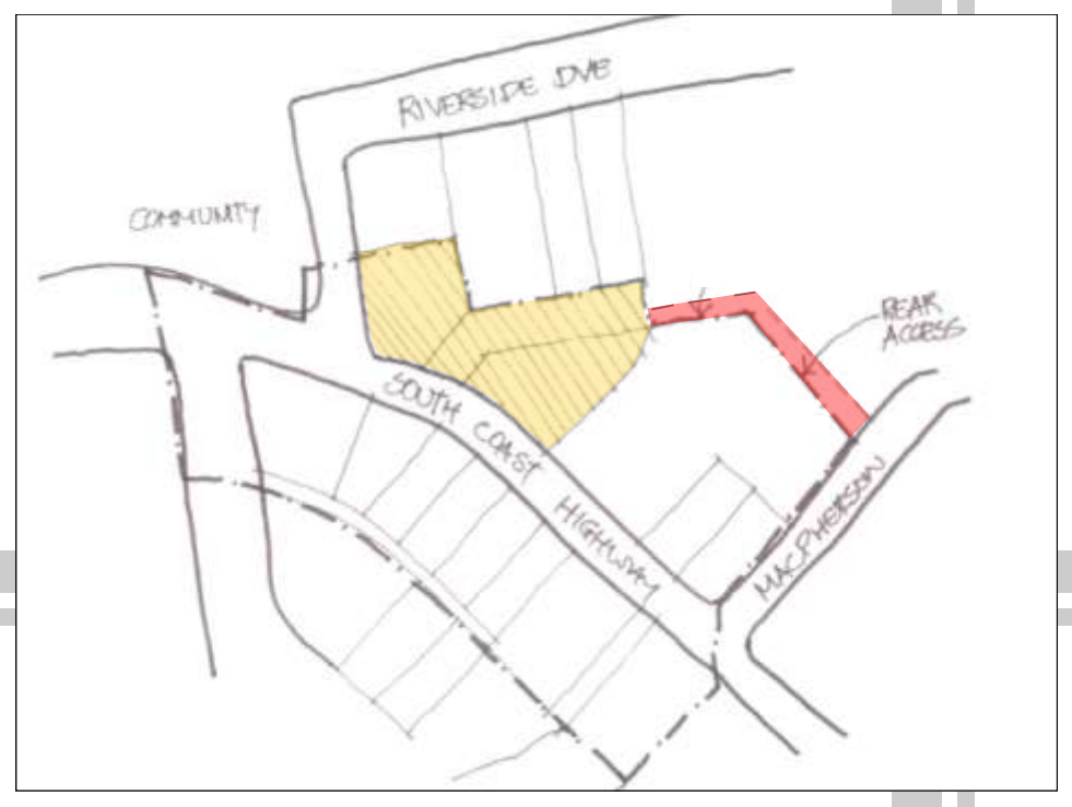
FIG 2.5: Proposed area of future commercial development (yellow) within the centre of Nornalup. Rear access (red) shown to area of possible future 1,000m<sup>2</sup> residential lots (green).