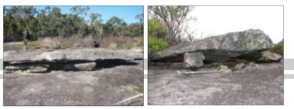
FIG 4.2: Typical lizard trap structure in the Walpole Wilderness Area.

A map showing the preliminary outcomes of this survey programme, bearing in mind constraints from very low ground surface visibility demonstrate an emerging pattern of the rich, complex archaeological heritage of this region.