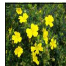
Cutleaf Hibbertia Hibbertia cuneiformis