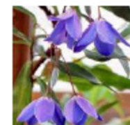
Australian Bluebells Billardiera heterophylla