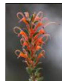
Basket Flower Adenanthos obovatus