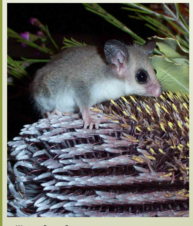
Western Pygmy Possum (Cercartetus concinnus)