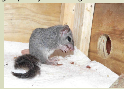
Brush-tail Phascogale (Phascogale tapoatafa)

In areas where hollow logs or trees have been removed, nesting boxes can provide a predator proof, safe house for nesting creatures. They have been used successfully to increase the breeding capacity for a range of creatures.