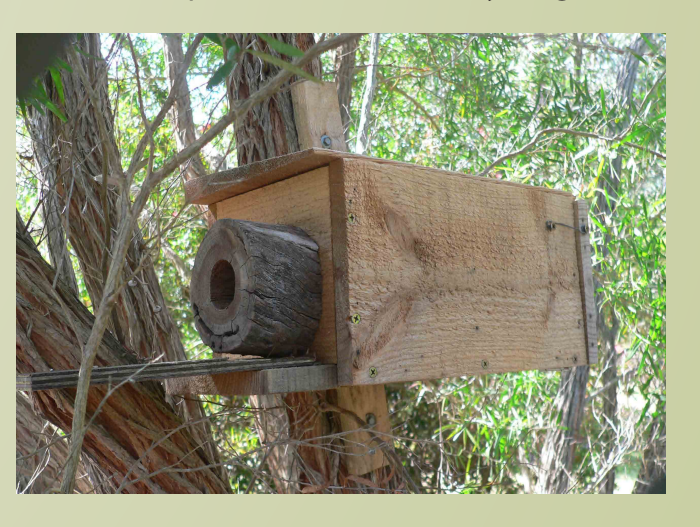
Pygmy Possum Nest Box (Cercartetus concinnus)

Consider using nest boxes for wildlife in your garden. Remember - wildlife will only use the boxes if there is adequate food available in your garden.