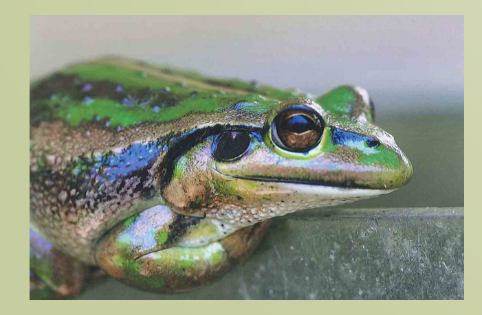
Motorbike Frog (Litoria moorei)

Not only are chemicals harmful to frogs but also to the creatures that eat them such as tiger snakes. Native predators are important for keeping a balance in any ecosystem and it is important that we consider their needs also.