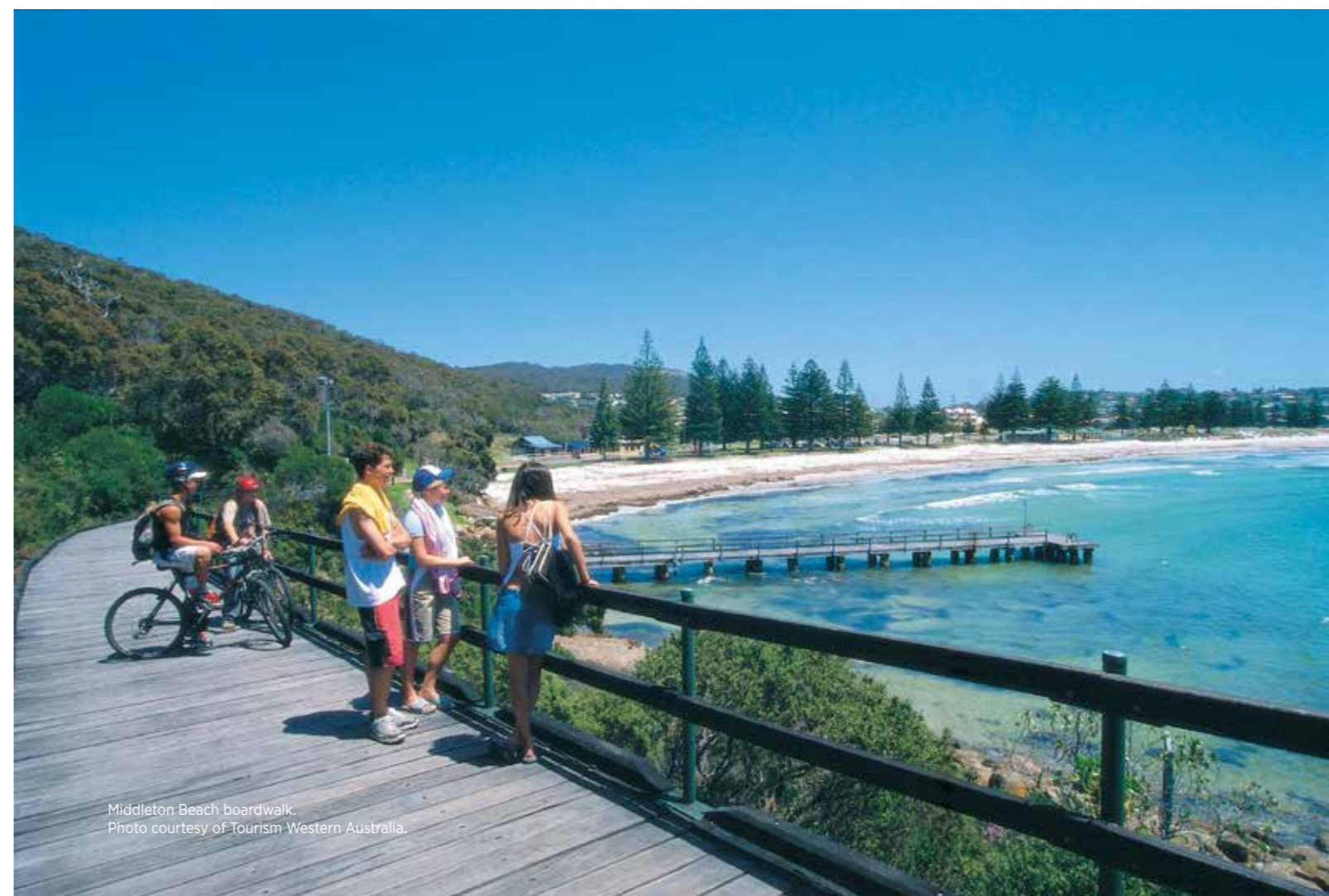
Middleton Beach boardwalk.

An extensive trail network will link forests, rivers, lakes, coastline, national parks and nature reserves across the entire region, creating a unique economic stimulus for rural and regional development, while simultaneously, providing major public good benefits in terms of health, wellbeing, environment, heritage and conservation. The outlay in infrastructure will be compensated for by creating a healthy active community which reduces the health burden and increases visitor spend and employment.