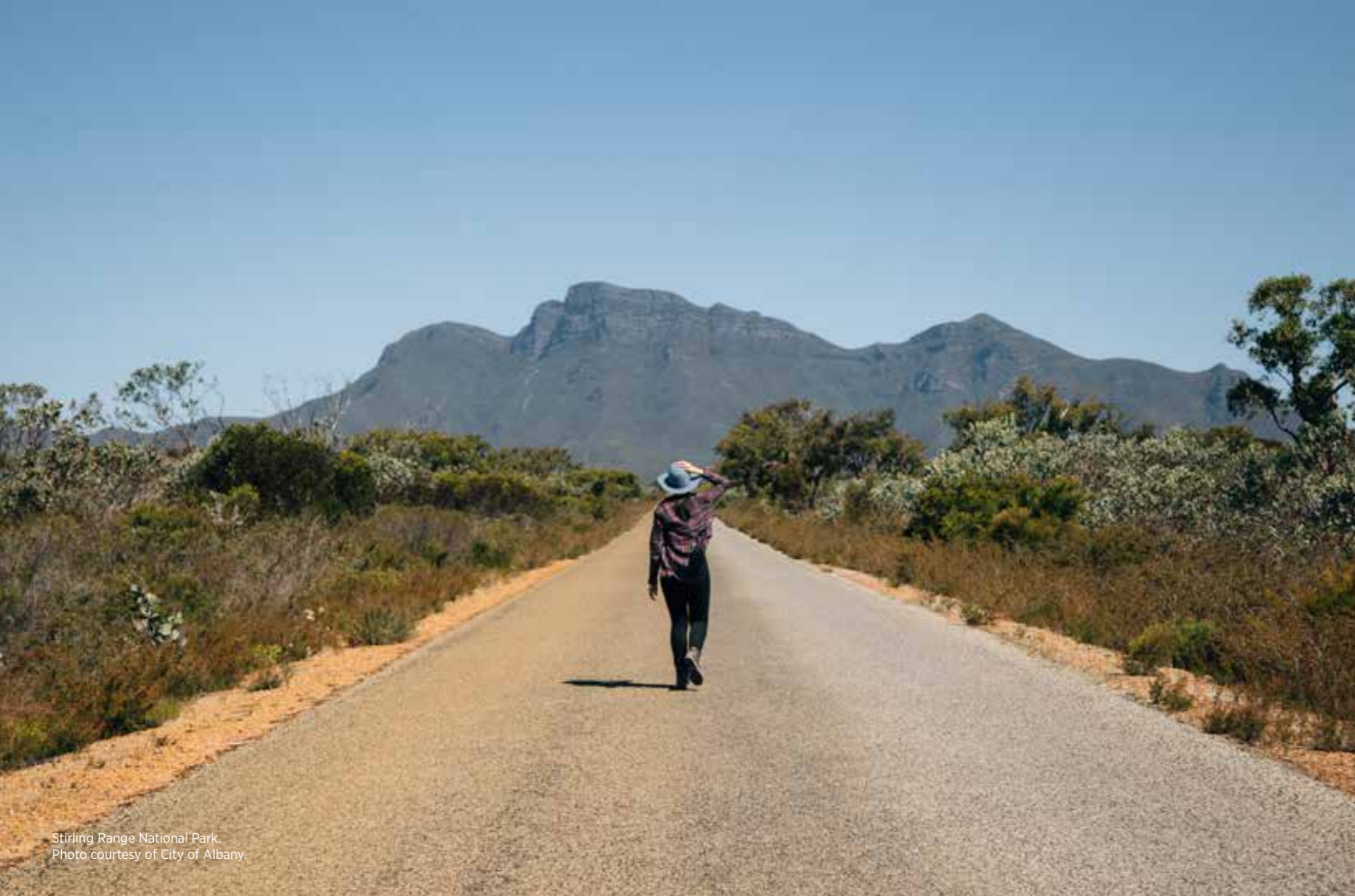
Stirling Range National Park