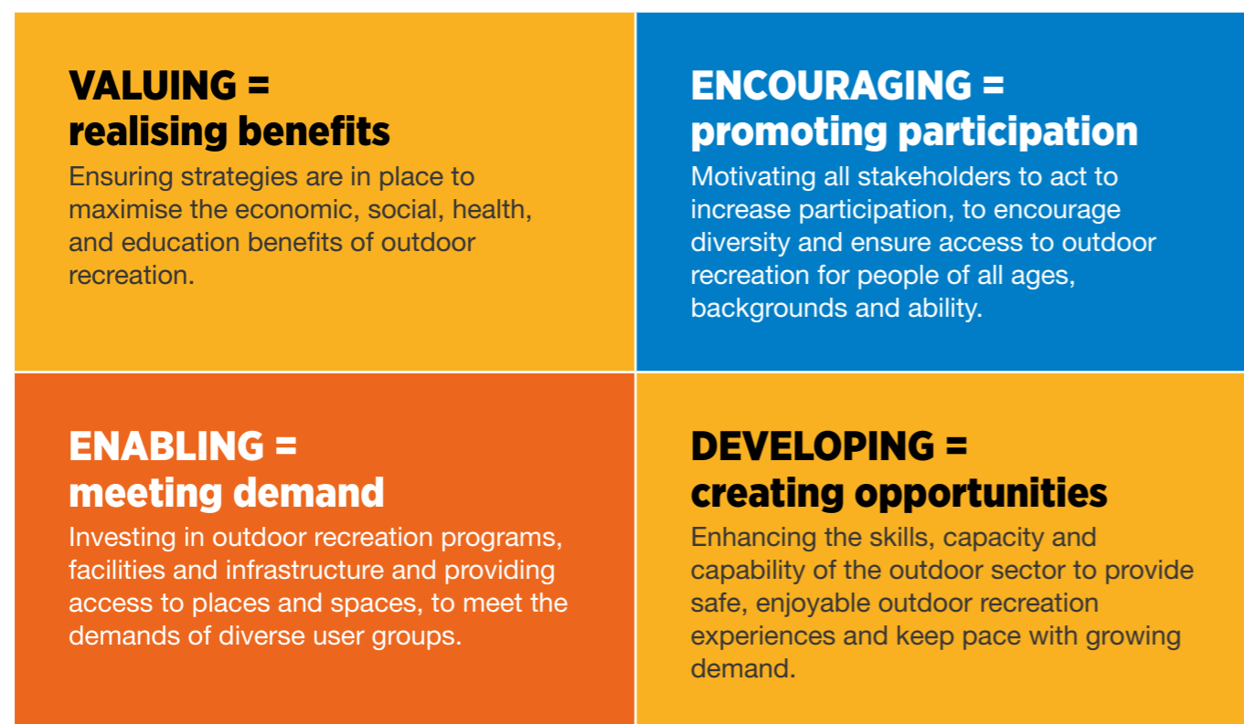
Figure 1: Fundamental Objectives of WA Outdoor Recreation Framework

The Great Southern Outdoor Recreation Strategy forms part of the Western Australian State Government’s tiered planning and investment framework and is embedded in both the Framework for Outdoor Recreation in WA 2018, the WA Strategic Trails Blueprint 2017 – 2021 and other activity-specific strategies (e.g. the WA Mountain Bike Strategy 2015-2020) (see Figure 2) 1 .