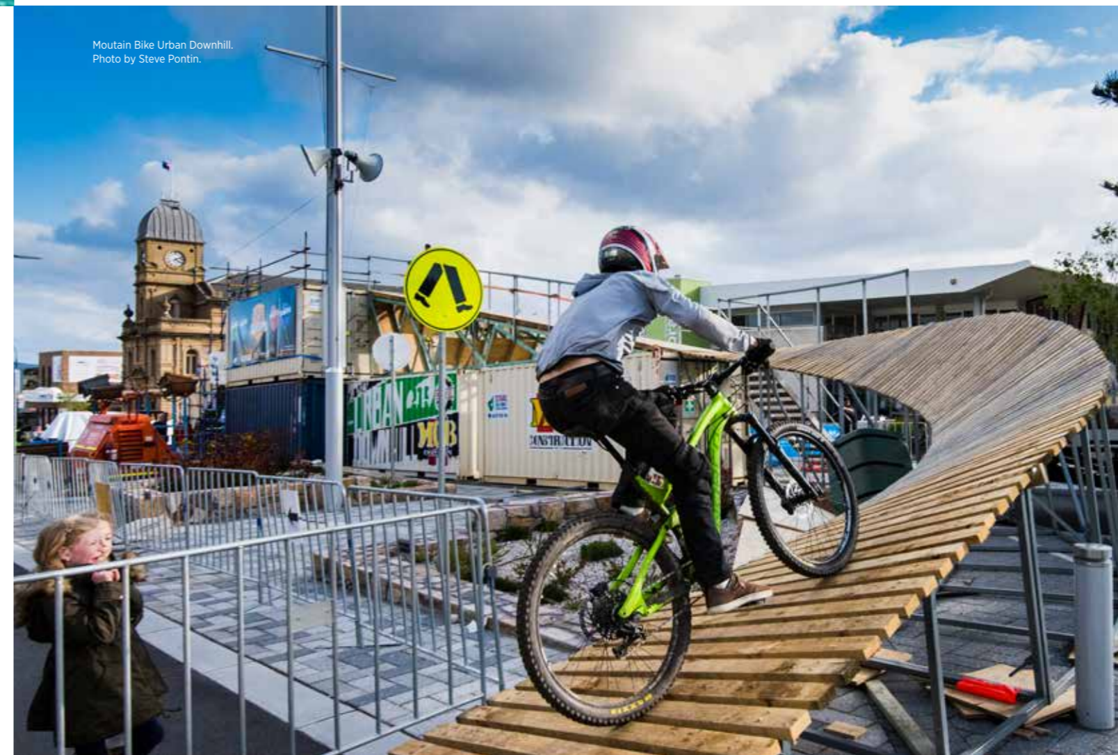
Mountain Bike Urban Downhill.