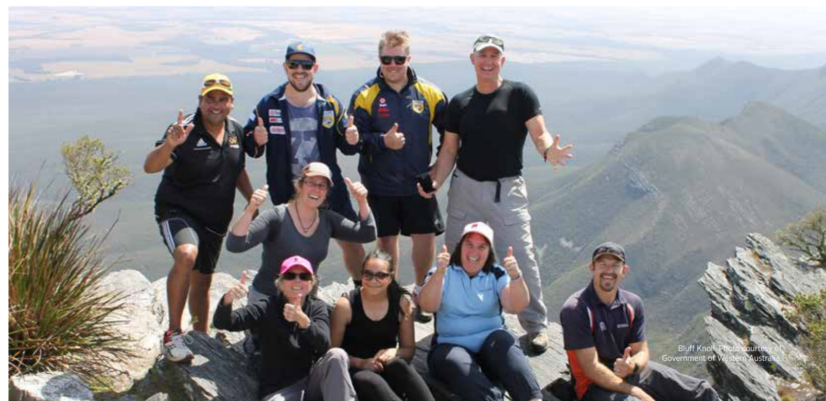
Bluff Knoll.

This Strategy provides a coordinated approach that will ensure better planning for the development of future services and infrastructure and lead to more efficient long-term management of existing outdoor recreation activities, programs, events and infrastructure.