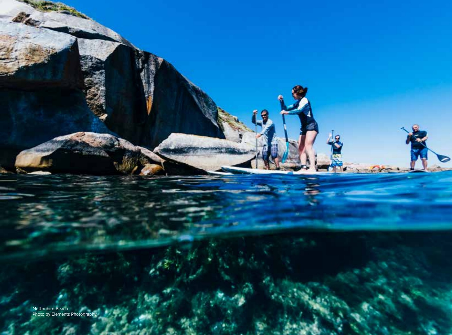
Muttonbird Beach.