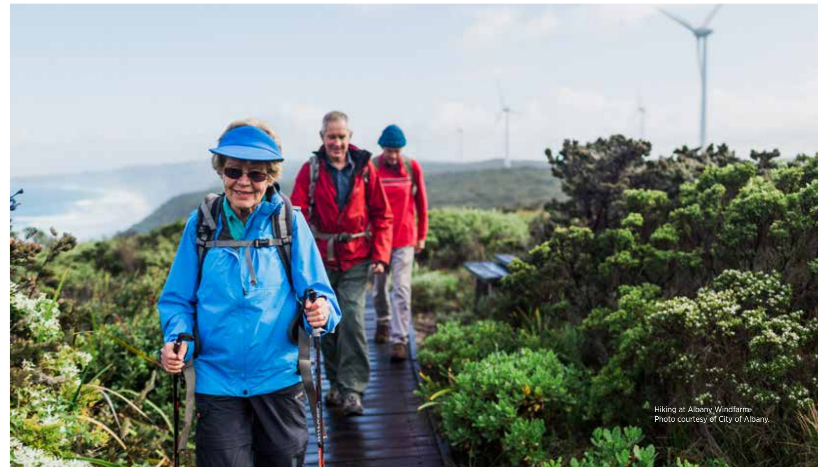
Hiking at Albany Windfarm.