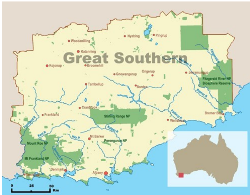
Figure 1: Great Southern Regional Area

This plan has been developed having regard to emerging needs and trends and relative priorities for each local government and the region as a whole.