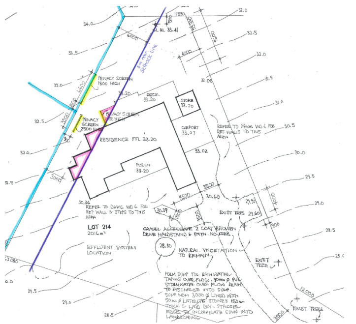
Fig 2 – Amended Site Plan illustrating extent of building intrusion into the 6m rear setback line (pink), and screening such that the development is compliant with visual privacy setback requirements (yellow).

As referenced above, amended plans were lodged by the applicant in response to the submissions received, noting that these plans, with the exception of the south and west elevations, are the plans submitted for approval – refer Attachment 8.1.1b. The amended plans address the visual privacy setbacks via the provision of screening such that the development complies with the Deemed-to-Comply criteria of the R-Codes that relate to visual privacy setbacks, and increase the rear setback from a minimum of 1.8m to 3m via a minor modification to the floor layout. As a 6m rear setback is required in the R5 zone, the proposal remains non-compliant with the Deemed-to-Comply criteria of the R-Codes and a setback variation is therefore sought.