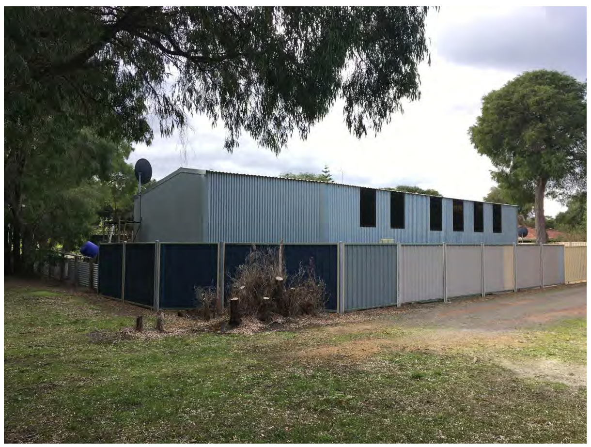
View of truncated south/west corner of outbuilding from edge of Lot 103 and Peaceful Bay Chalet site.