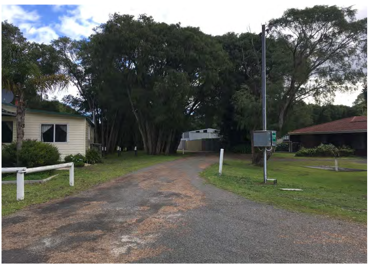
View from Peppermint Way of crossover to battle-axe driveway to Lot 103 to the rear of the subject property. Building to the left forming part of Peaceful Bay Chalets.