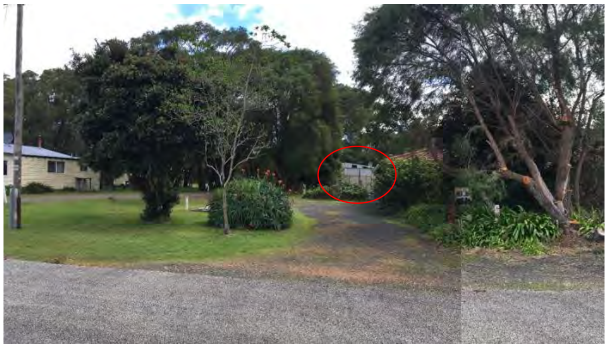
View from Peppermint Way, shed circled.