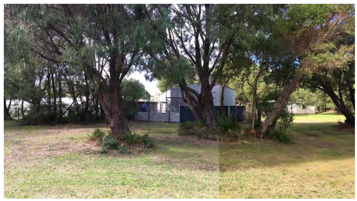
View of the rear of the outbuilding from Lot 103.