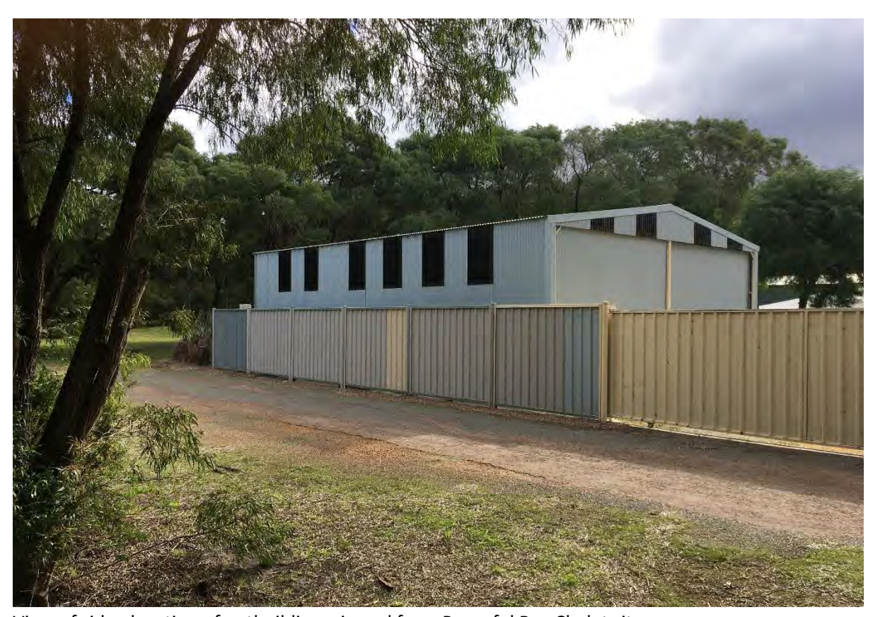
View of side elevation of outbuilding, viewed from Peaceful Bay Chalet site.