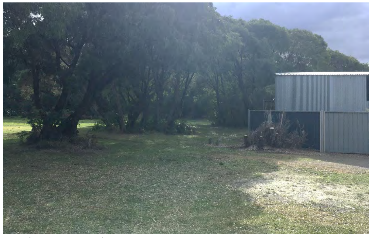
View of truncated corner of outbuilding and Lot 103 to the rear.