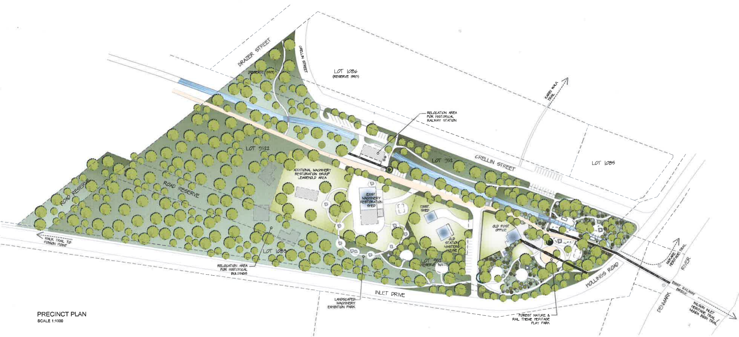
PRECINCT PLAN SCALE 1:1000

NATURAL PLAY ENVIRONMENTS NATURAL ENVIRONMENTS ARE DYNAMIC, CONSTANTLY CHANGING IN SPACE AND TIME AND CONSIST OF A VARIETY OF HIGHLY COMPLEX HABITATS. THESE SPACES OFFER CHILDREN A MULTIPLICITY OF ENCOUNTERS AND SENSATIONS, A DIVERSITY OF TOPOGRAPHY, TEXTURES AND A VARIETY OF CHILD-SIZED SPACES, HIDEAWAYS AND HOLES TO EXPLORE AND INHABIT.