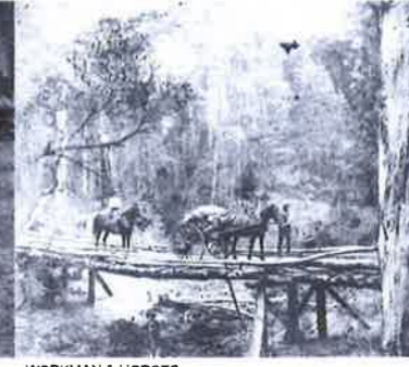
WORKMAN & HORSES