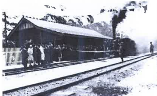
DENMARK RAILWAY STATION