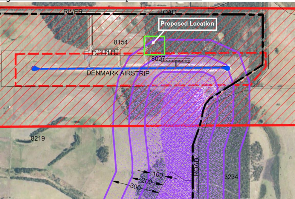
Fig 1.2: Recommended Buffer Separation Distances.

Prior to considering the proposal in detail, it is considered appropriate to refer the matter to Council for consideration.