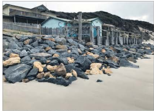
The new Ocean Beach seawall will protect the beach and surrounding infrastructure.

After the patrol room was left protruding into the sea the Denmark Surf Life Saving Club put out a call to empty its contents into a storage room. Since 2019 the surf club has been