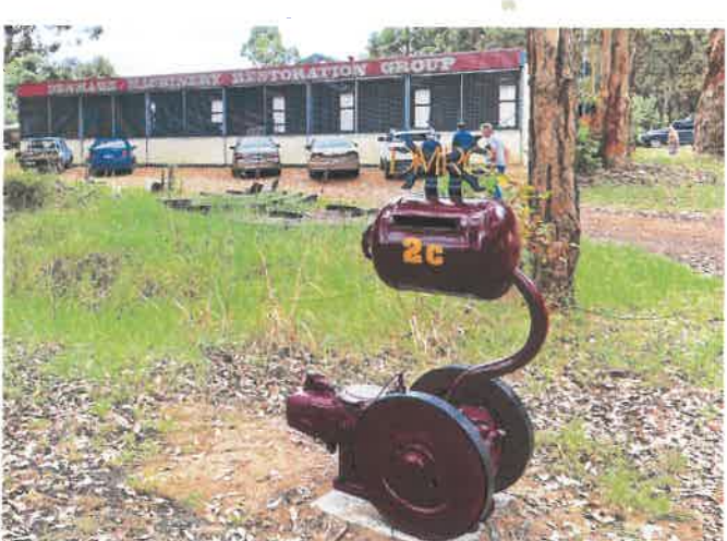
2c Inlet Drive Denmark (Opposite Rivermouth Caravan Park)