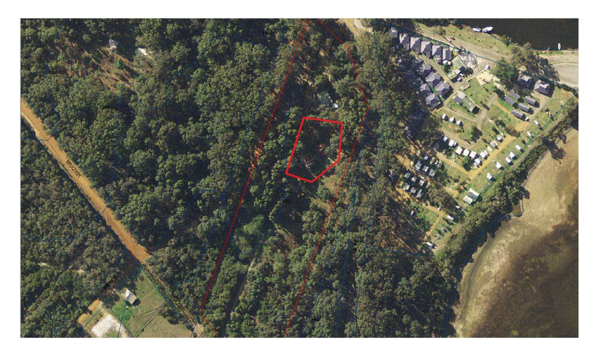
AERIAL PHOTO: (NB: refer to attached survey for property boundaries)