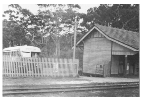
DENMARK RAILWAY STATION 1950