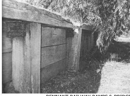
REMNANT RAILWAY RAMPS & BRIDGES