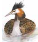
Great Crested Grebe

Nenamup Inlet and Youngs Lake (2c) . South of Morley Beach Nenamup Inlet is good for waterbirds, and waders if water is low enough, but access is difficult - seek local advice (see contacts). For Young's Lake, which has deeper water, park at the school bus turn-around on Eden Rd (at the sharp bend 50m before the floodgates on the drain which connects Nenamup & Youngs). Follow the short track leading off to the north. Look for grebes, cormorants and ducks.