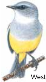
Western Yellow Robin

These roads lead through cleared agricultural land and Jarrah/Marri forest located to the north-east, between the Denmark-Mt. Barker Road and the South Coast Highway, approximately 6km to 10km from Denmark. Look out for Crested Pigeon, Western Yellow Robin, Varied Sittella, Grey Currawong and Rufous Songlark.