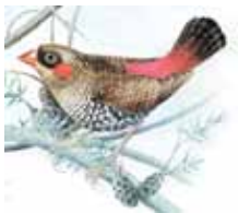
Red Eared Firetail

This is a formed walk/cycle trail following the banks either side of the Denmark River between the road bridge on South Coast Highway and the entrance to the Rivermouth Caravan Park. The diverse flora includes overhanging paperbarks, Karri and banksias where many birds can be seen, including Nankeen Night-Heron, White-winged Triller and Red-eared Firetail.