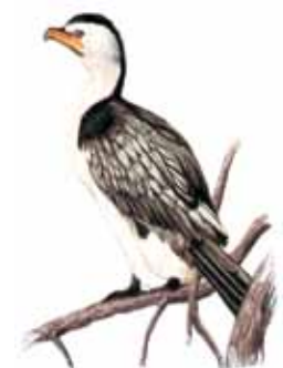
Little Pied Cormorant