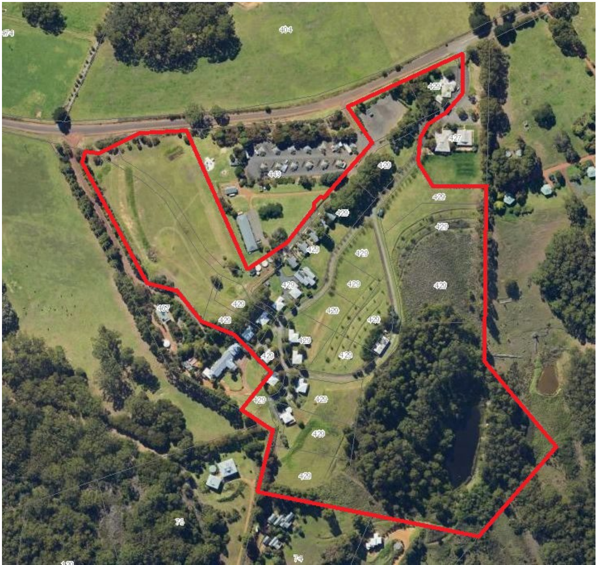
Figure 2 – Site Plan