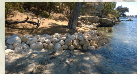
Image 1: Example bank protection works (Photos for illustrative purposes only).

New track and stairs to Ocean Beach. Stairs to include viewing platform. See Image 4-6.