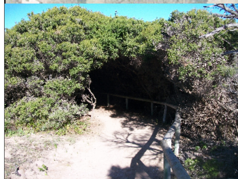
Image 6: Example coastal trail (Photos for illustrative purposes only).