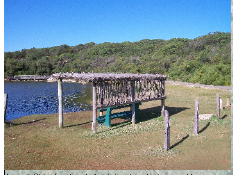
Image 8: Style of existing shelters to be retained but improved to feature fully enclosed rear wall.