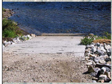
Image 7: Example disabled access to water (to include a hand rail) (Photo for illustrative purposes only).