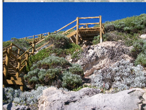
Image 5: Example staircase (Photos for illustrative purposes only).