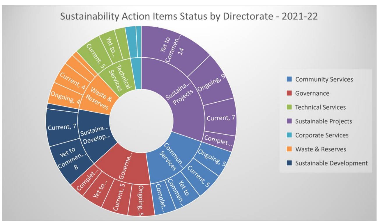
Figure 3: Status of Sustainability Action Items by Directorate 2021-22