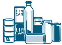
Steel & aluminium cans

Place only the following items, loose and rinsed in this recycling bin.