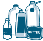
Plastic bottles & containers

Remove lids, no crockery, pottery, porcelain, window glass or mirror glass