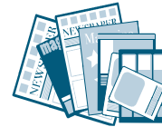
Newspapers office paper magazines & junk mail

Do not bundle or tie, remove plastic wrapping