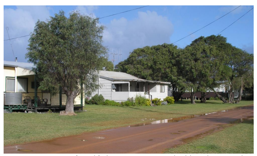
Properties opposite (south) showing consistent building design and same small verandahs to front.