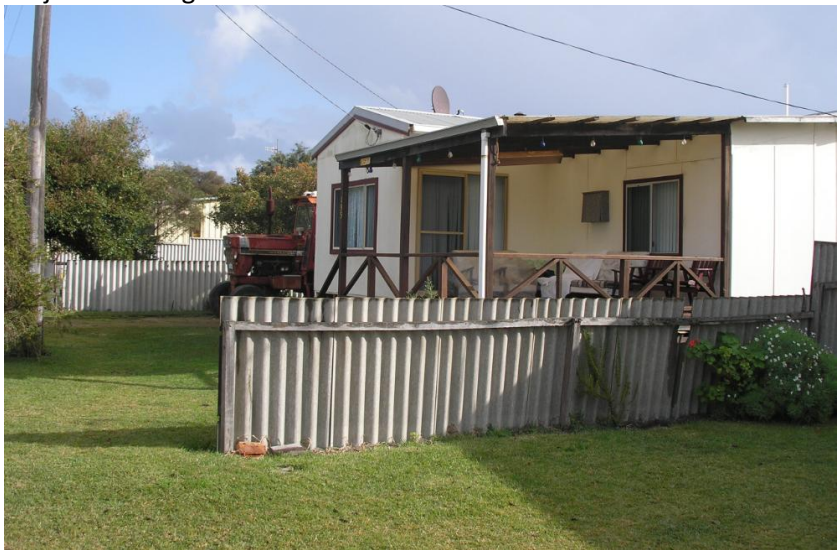
Property to the west. Small verandah existing.