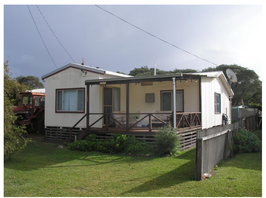
Property to the west. Same property.