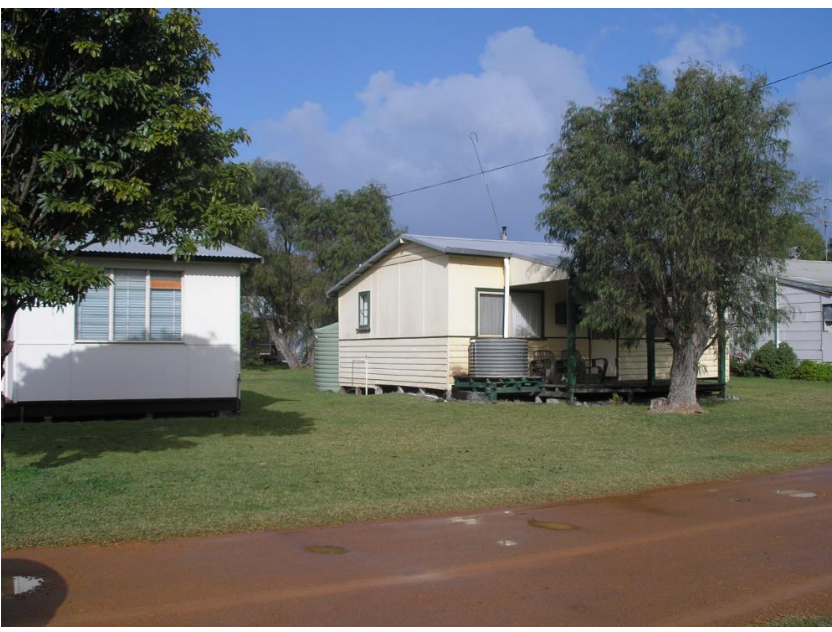
House opposite looking south.