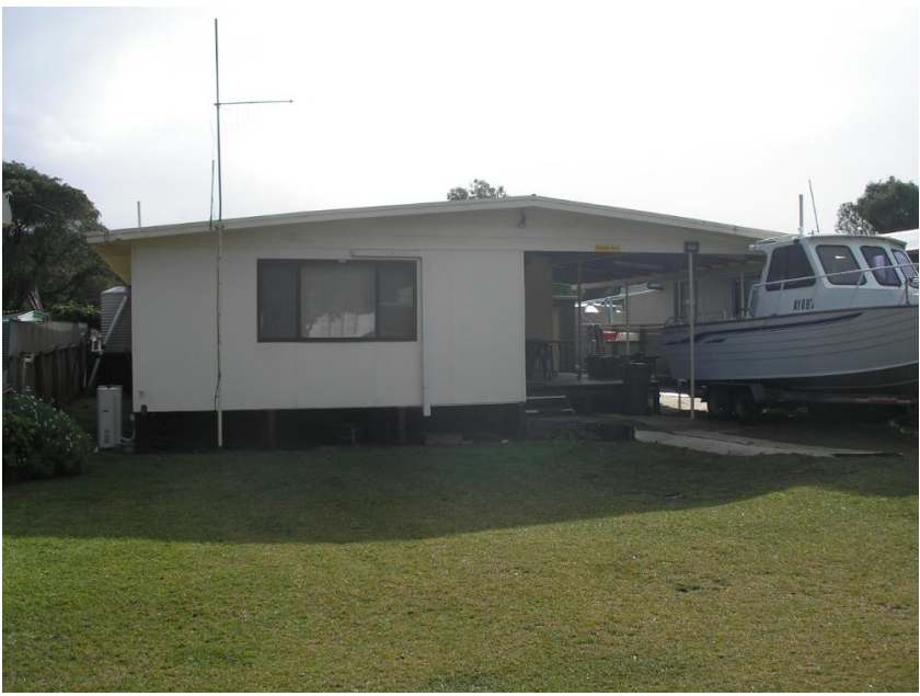
Front of dwelling. Verandah proposed to extent 4m toards front of house and along entire front elevation to edge of boat.

SITE PHOTOS JUNE 2011 – PROPOSED FRONT VERANDAH.