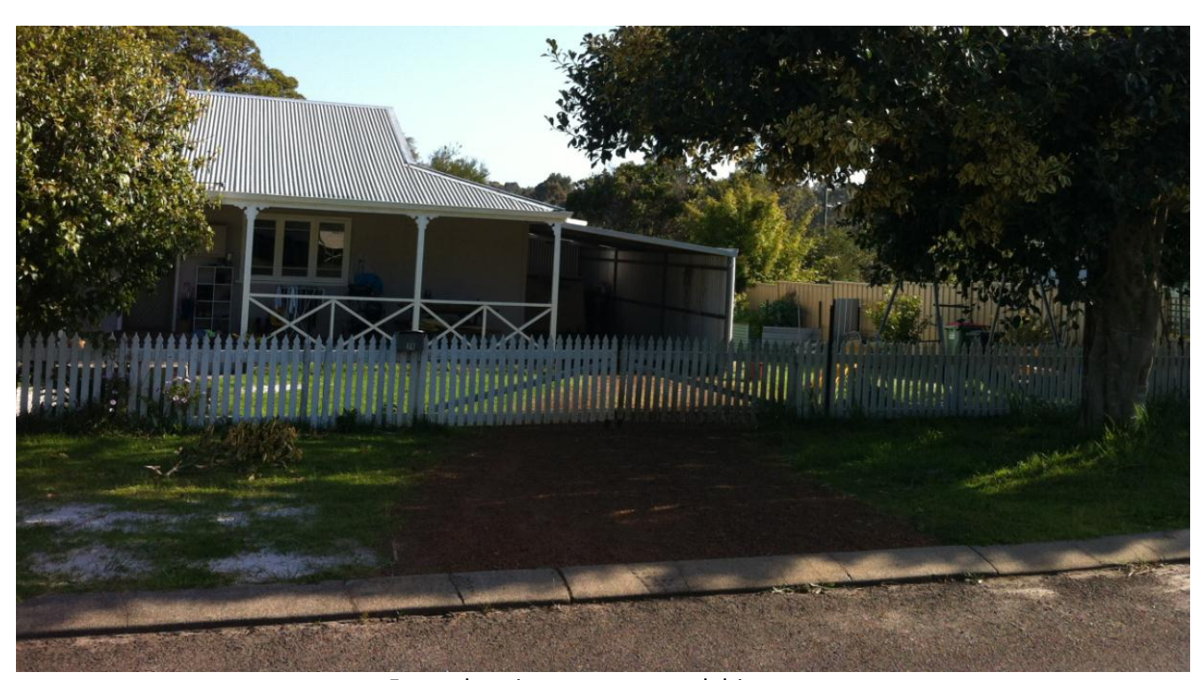
Front elevation, crossover and driveway