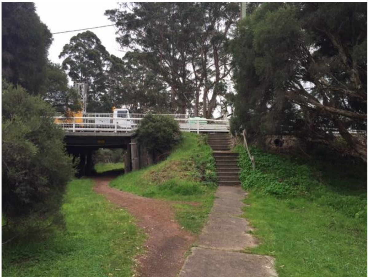
Above - North Eastern Access

Pictured below is the only access directly from the trail to the Traffic Bridge on South Coast Highway. Trail users can, of course, go under the bridge to the opposite side of the road, however the only access back onto the Traffic Bridge (from that side) is up a steep, gravel driveway and across the road back to the footpath on the southern side of the bridge.