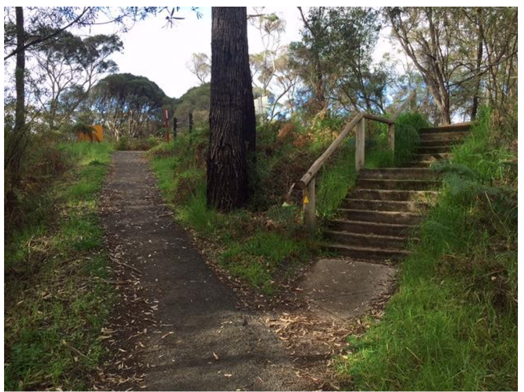
Above - South East Access

The picture below shows the current access at the south, eastern end of the Trail and, in the Officer's opinion and whilst perhaps not fully compliant to disability accessible standards, it is functional and would provide sufficient access for most people. The access is also compatible, if not better than, the condition of the rest of the eastern side of the trail.