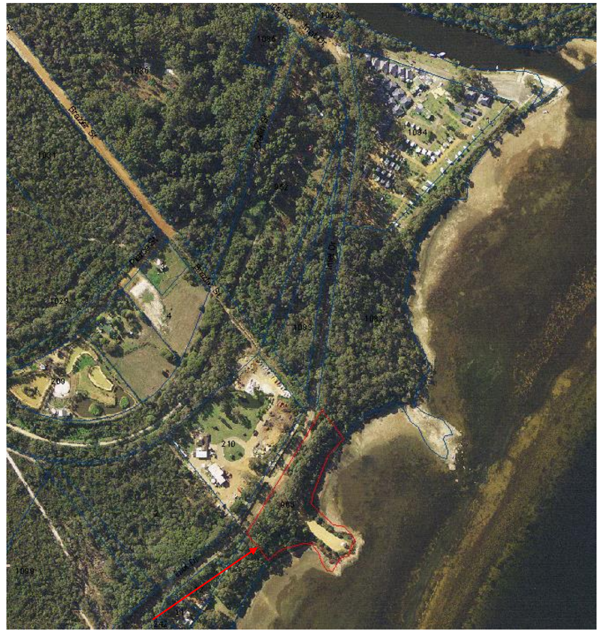
Above: Ricketts Reserve (1.195ha)

Perceptions of safety, security and the like can easily be dealt with cheap modern security features and access to the current boat launching facilities at the Rivermouth or Denmark River are no greater distance from this Reserve than across the road on the Heritage Precinct. In time – with planning and grants – launching, retrieval and/or even mooring of yachts can hopefully occur at the Yacht Club Reserve itself. Surely that would be the ideal scenario for the Club to work towards.