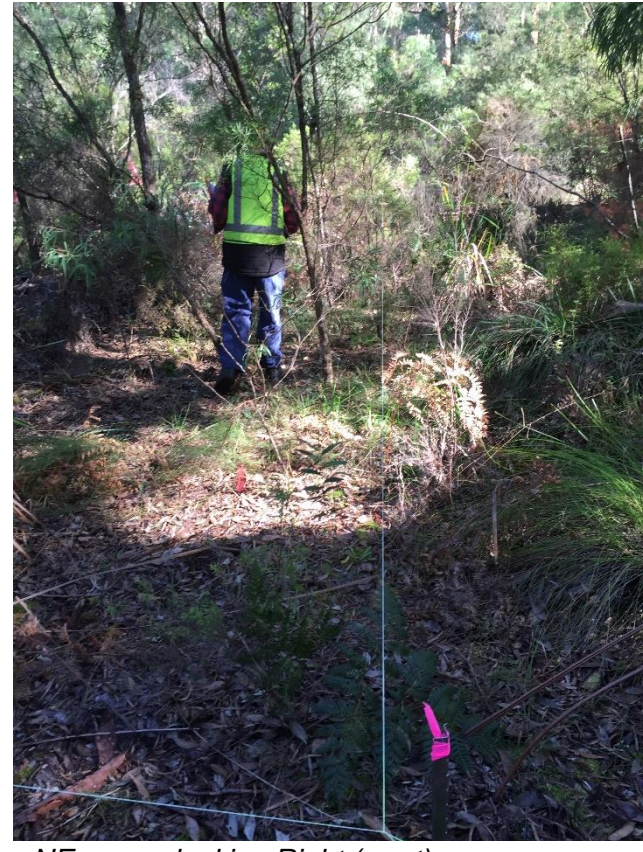
NE corner looking Right (west)