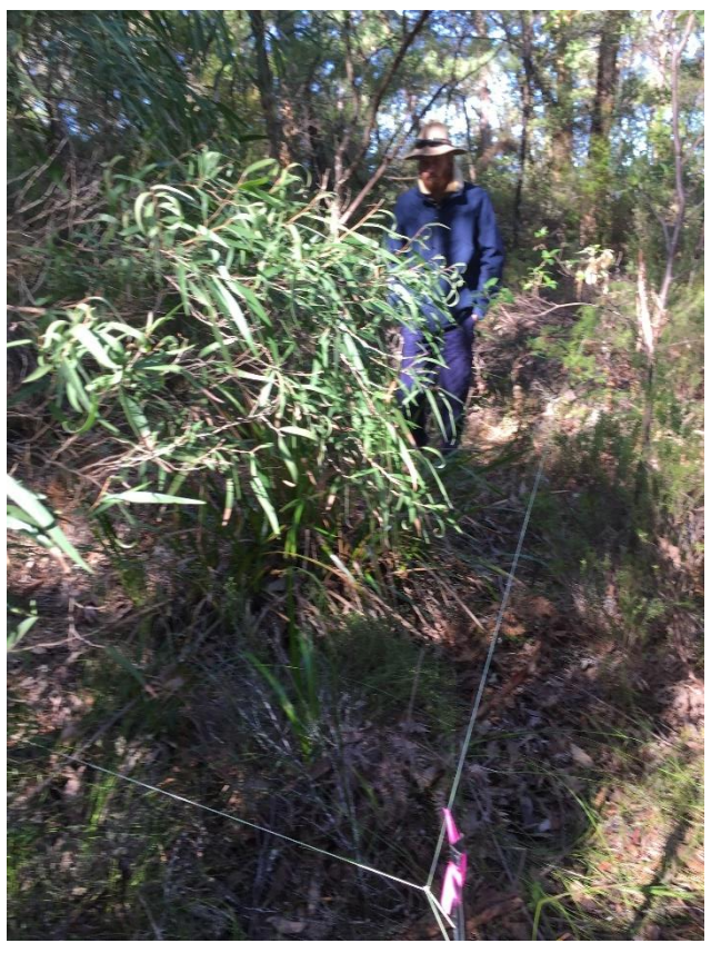
NW corner looking Right (south)