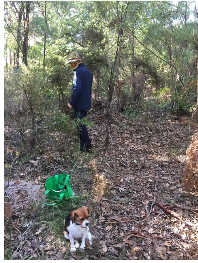
SW corner looking Right (east)