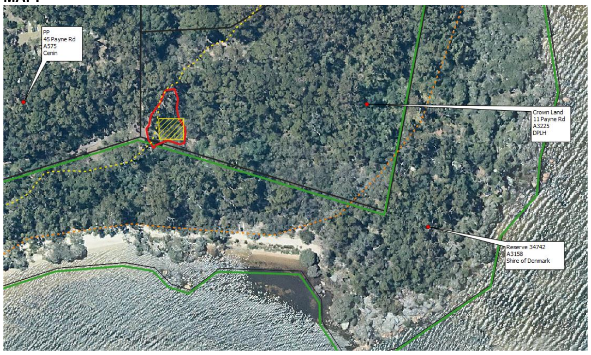
10m x 10m quadrat within proposed cultural burn area in Crown Land on Wilson Inlet foreshore near the Cove Beach