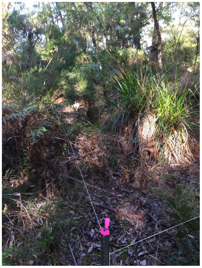
NE corner looking Left (south)