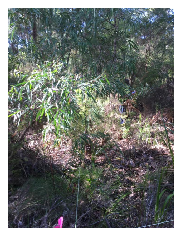
NW corner looking Left (east)