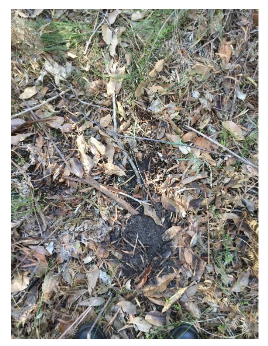
Evidence of Isoodon fusciventer (Bandicoot/Quenda) diggings within the quadrat