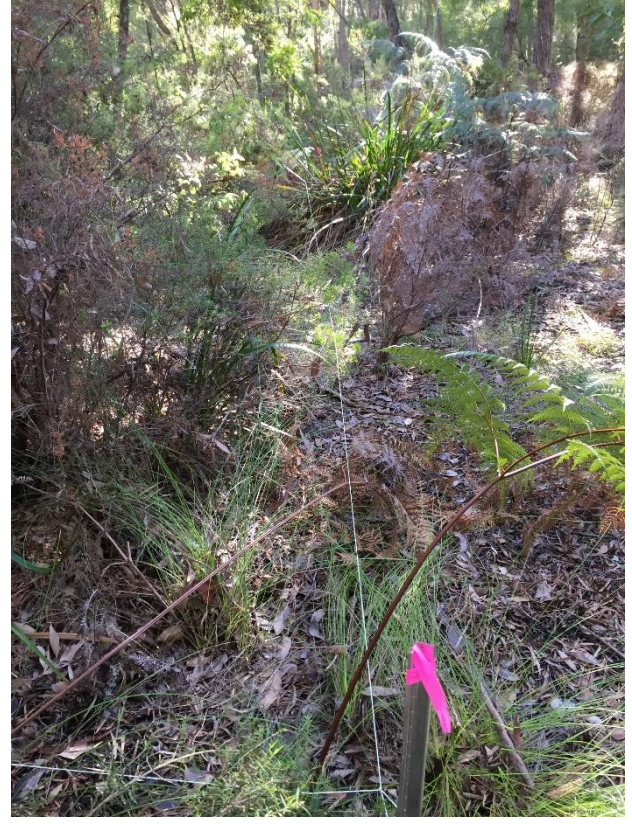
SE corner looking Right (north)