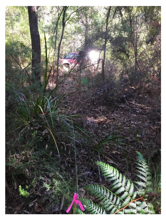
SE corner looking Left (west)