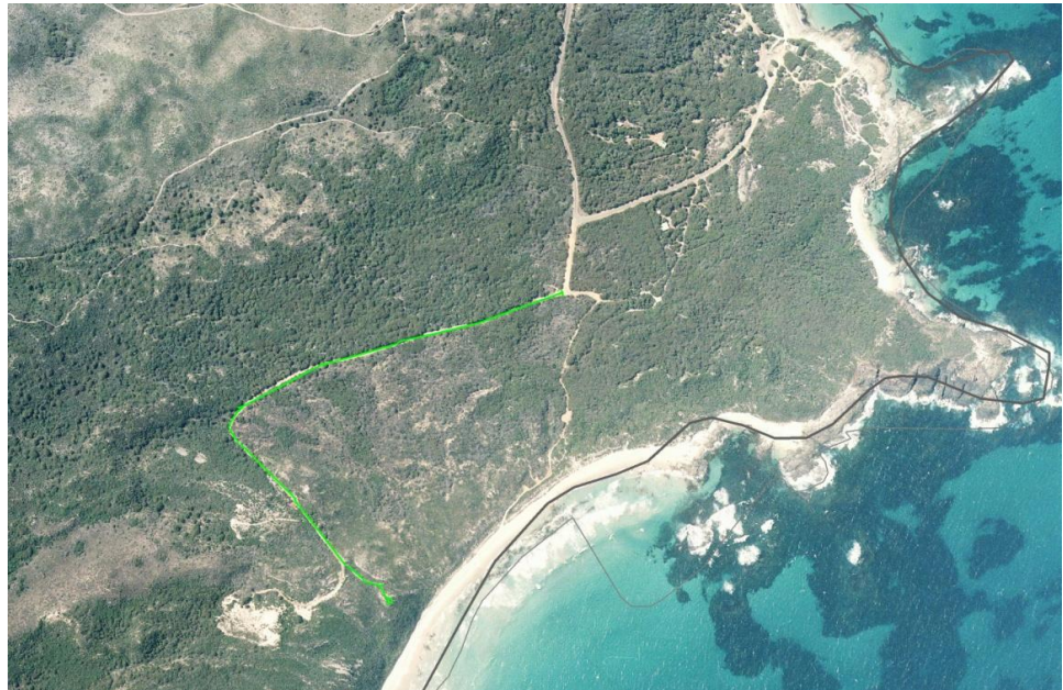
Picture 2 - Proposed Bill Pinniger Walk Trail & Lookout (within Reserve no. 20928)