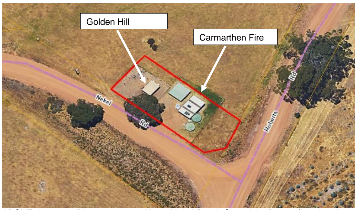
ABOVE: Lot 1 on Diagram 27184, No. 4 Nekel Road, Scotsdale

The land is owned freehold by the Australian Telecommunications Commission. Telstra have telecommunications exchange equipment on the site, 'Golden Hill Exchange'.