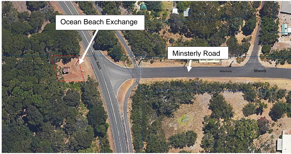
ABOVE: Lot 8171 on Deposited Plan 30137 (No. 466 Ocean Beach Road, Ocean Beach)