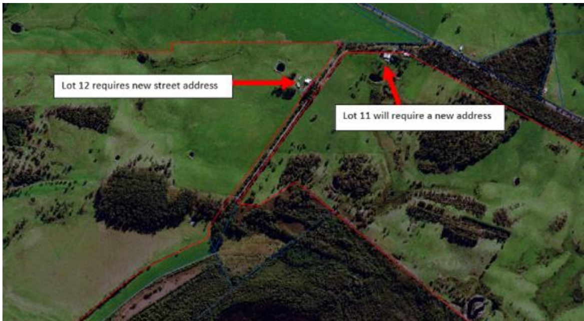
ABOVE: Image showing residences on unnamed Road reserve requiring new addresses for emergency services and rates purposes.

Two residences exist on the unnamed road reserve and their associated address is off South Coast Highway.