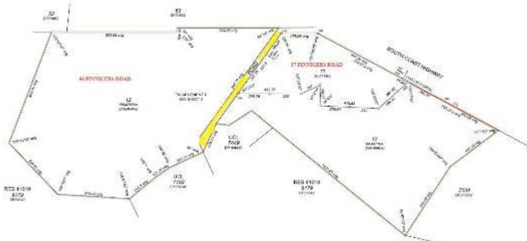
ABOVE: Deposited Plan 422045 showing the unnamed Road Reserve (highlighted)

Two residences exist on the unnamed road reserve and their associated address is off South Coast Highway.