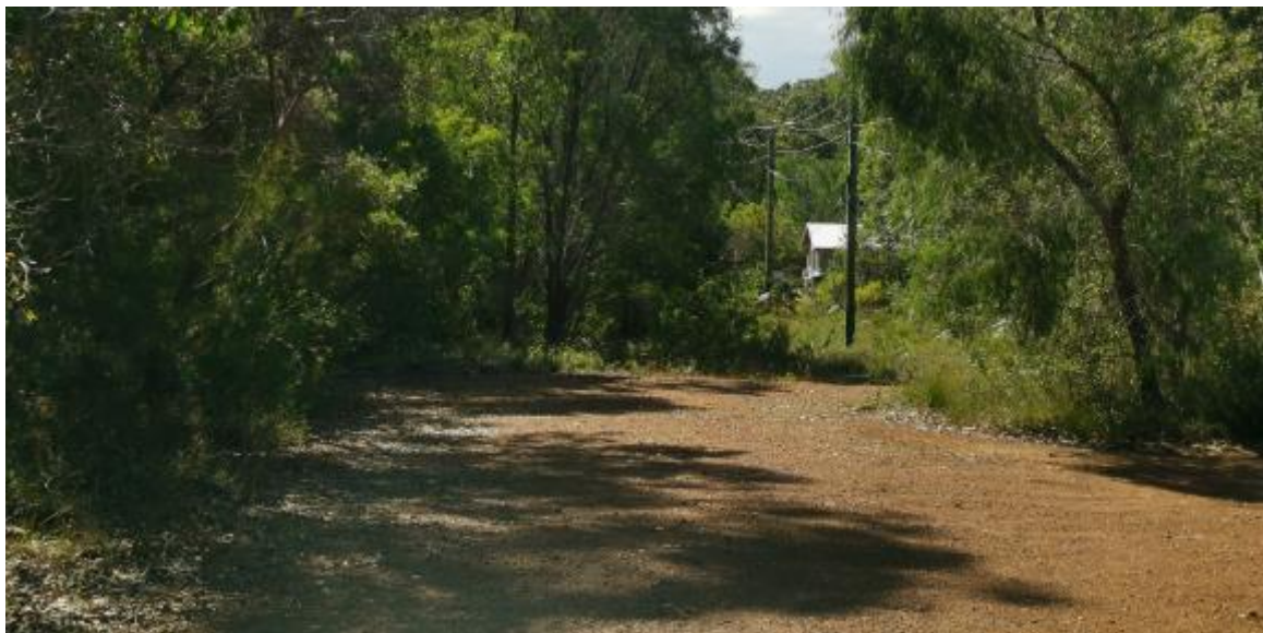
ABOVE: Remains of Pinniger Point Road, Denmark, looking north to 1 Crowea Road.

'Pinniger Point Road', located off Inlet Drive, was to be removed in 1992 by Landgate but the action was inadvertently not followed through. Pinniger Point Road had been replaced by Inlet Drive and Poisson Point Road (Attachment 9.3.1). A small remanent of this road still remains officially on mapping platforms but the road is unmade and not sign posted.