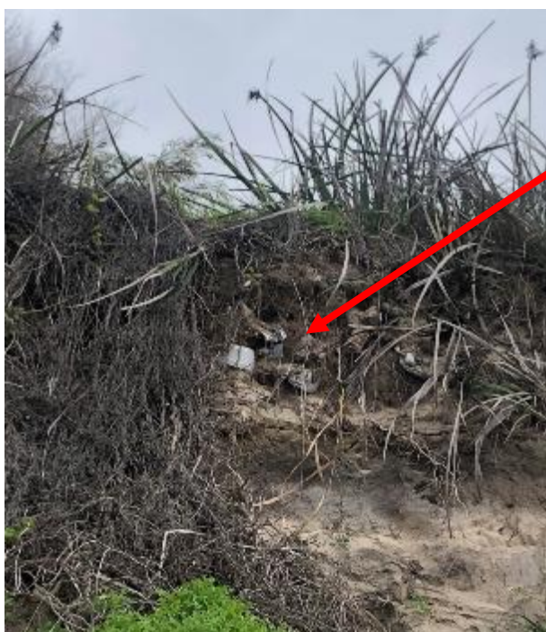
Waste exposed in adjacent dune

In the past few years, coastal erosion has uncovered rubbish in the sand dune directly adjacent to the lease area. The lessee advised that they were unsure who the rubbish belonged to and, that upon noticing the waste in the dunes themselves, they carefully removed any items that became exposed.