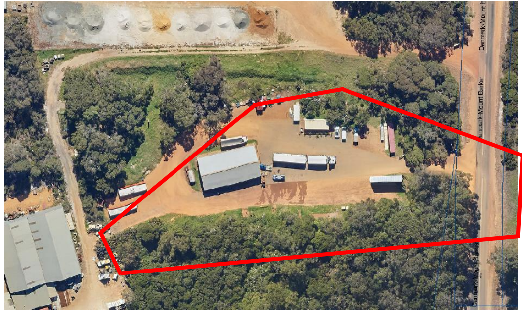
ABOVE: Aerial of Denmark Haulage Lease Area (outlined in red)

Should Council agree to a new lease, Council's intention would need to be advertised for public comment for a period of 14 days. A report will be brought back to Council to consider any submissions received.