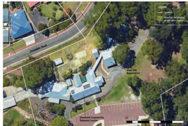
Proposed Community Garden No 2 (Lot 228) Strickland Street Denmark Morgan Richards Community Centre Proposed by: Green Skills All rights reserved. No responsibility shall be taken for any errors or omissions in this document. Please advise the Shire of Denmark if you have any questions or comments. Digital Content Data supplied by the Western Australian Land Information Authority.

This extension is shown in the second of the two maps below The reason for this proposed extension is that it covers an area that would be ideal for having delivery of resources and materials for the proposed Community Garden (ie dropping off a large load of woodchips). Currently there is a karri tree in this extension area, but there is no intension that this tree would need to be removed. It also covers a small area between the shed (currently used by Denmark Arts) and the bitumen area, which would be an ideal location for compost bins and a small rainwater tank.