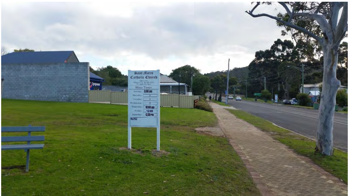
Closer view of the sign facing west.