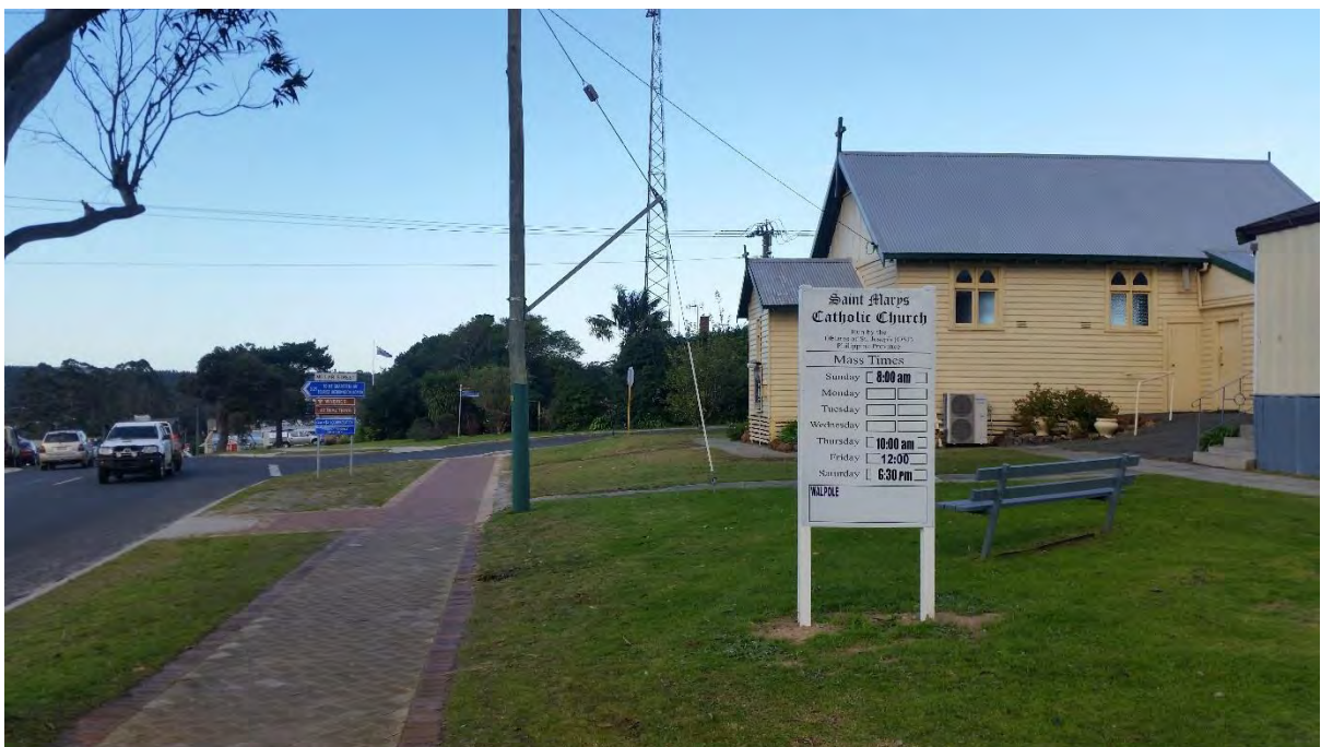
View of sign facing east. South Coast Highway visible on the left of the photograph.