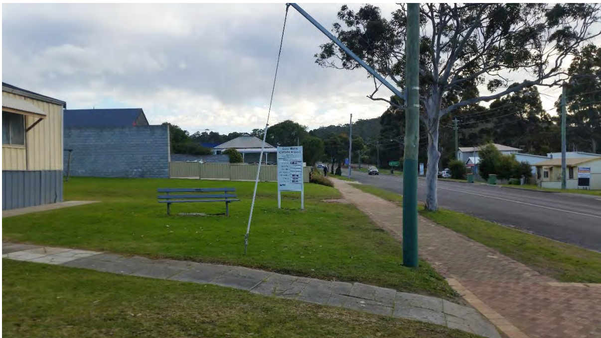
View of property facing west, taken from No. 55 (Lot 102) South Coast Highway. Sign has been installed without issuance of Development Approval.