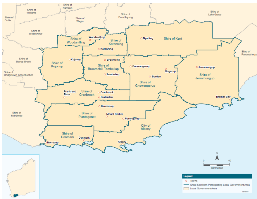
Figure 1 – Local Government Areas of the Great Southern