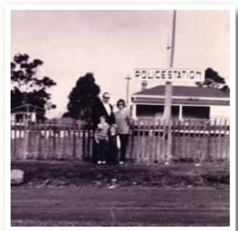
Police Station 1978.