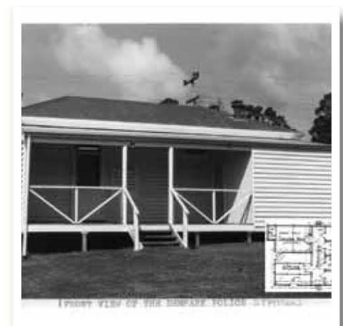
A view of the front of Police Station.