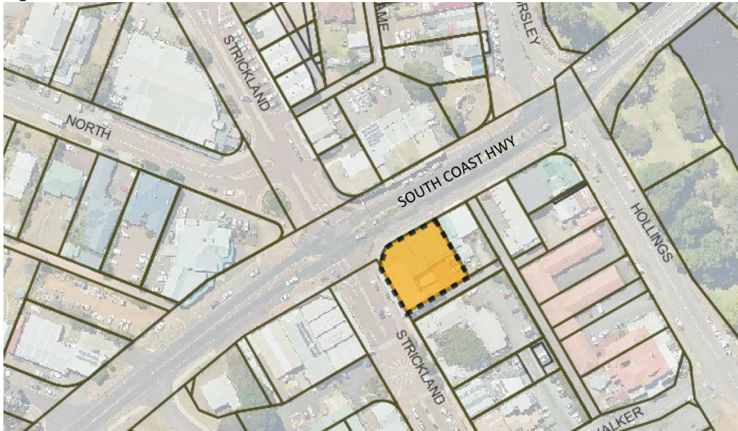
Figure 1 – Location Plan