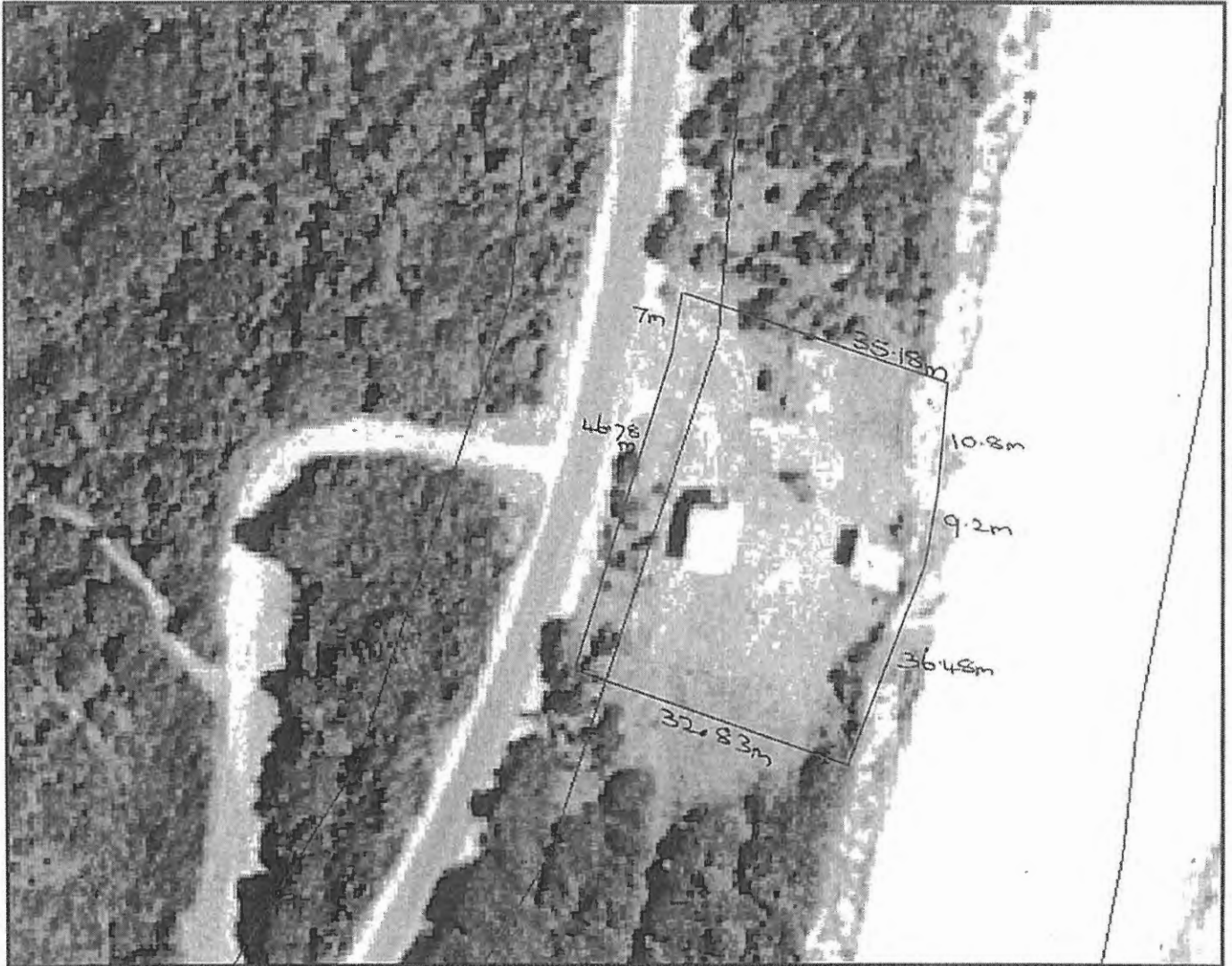
Figure 1 Portion of Reserve No 24510 and being Hay Location 2229 on Deposited Plan 240012

Indicative Boundary Only - Refer to survey for exact boundary lines